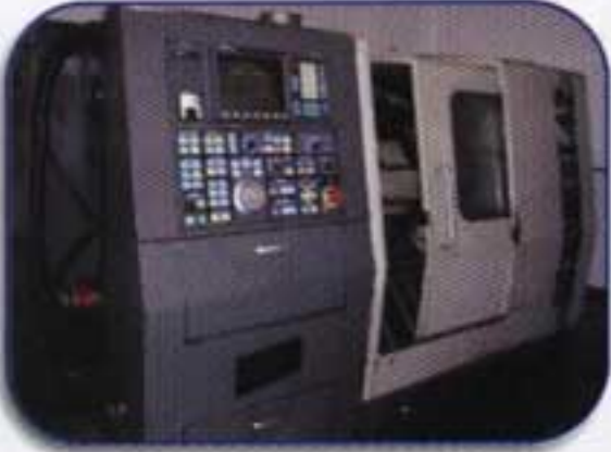
Hardinge 3 AXIS CNC Lathe Machine with Live Tooling