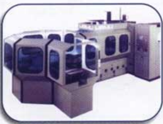
WAHLI W53 4 AXIS CNC Horizontal Machining Center