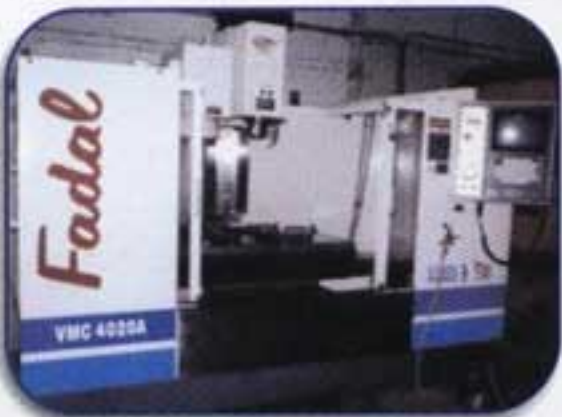
88HS 4 AXIS CNC Vertical Machining Center